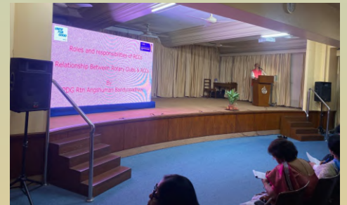
RCC Dist Assembly : Cohosted by Central Calcutta on 22nd June 2025 at Ramkrishna Mission Hall